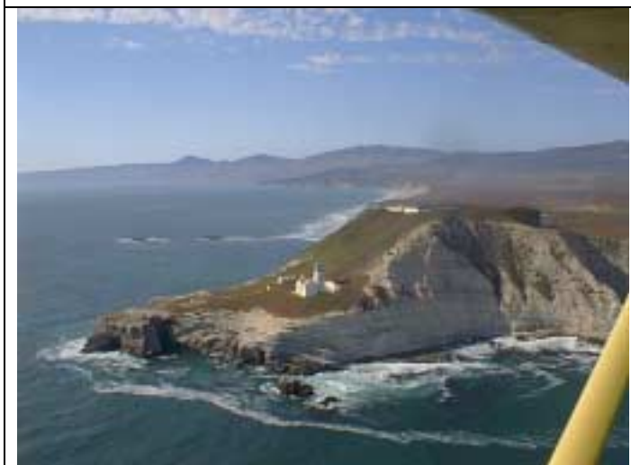
The Point Conception lighthouse sits on a rocky spit of land under the Vandenburg restricted area.